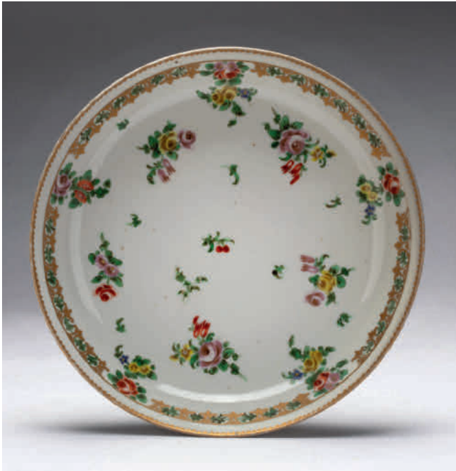
23. A Bristol saucer dish, painted in coloured enamels with scattered flowers and leaves, within a gilt border, panelled with leaves, gilt dentil rim, 8 ¼" diameter, circa 1772, no mark