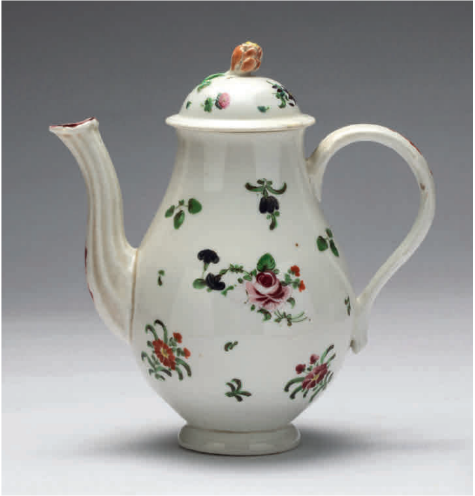
66. A Bristol small baluster shaped coffee pot and a domed cover, with crabstock handle, fluted spout and flower and leaf knop, painted in coloured enamels with two sprays of flowers and leaves, and scattered flowers, 6 \frac{3}{4} " high, circa 1772, no mark