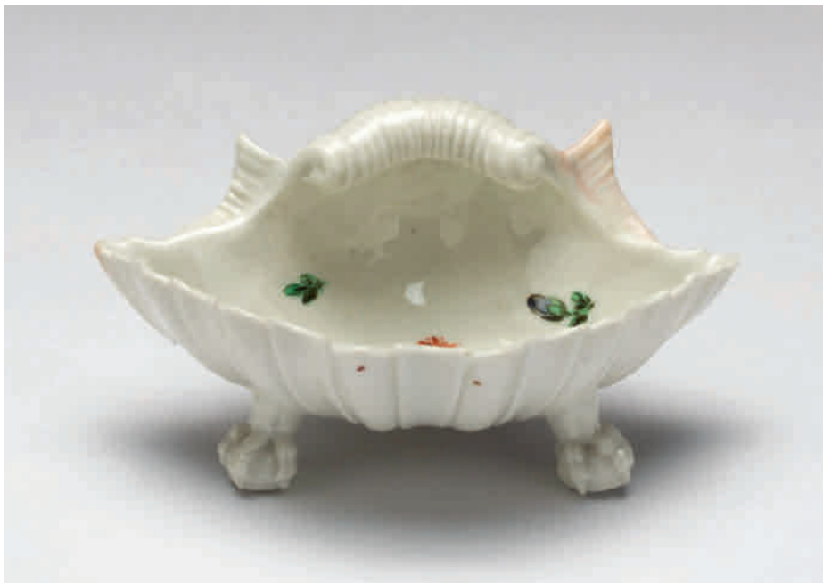
18. A rare Bristol shell shaped salt, the interior painted in coloured enamels with a spray of flowers and leaves and scattered flowers, on three claw and ball feet, 5 ¼" wide, circa 1775, blue painted X mark and numeral 6.

Provenance; Albert Amor Limited, acquired 17th March 2004