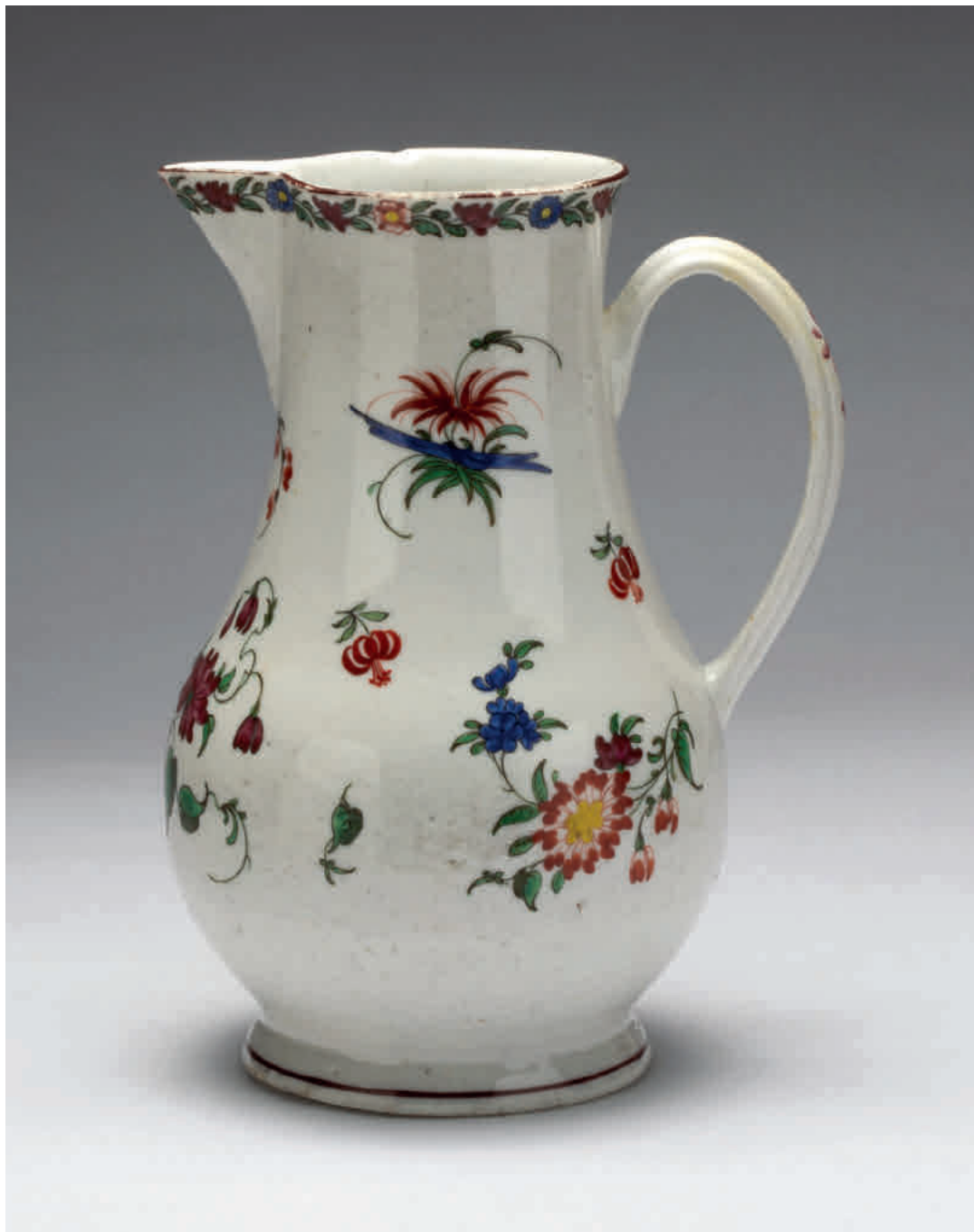
69. A Plymouth large baluster shaped jug, with notched loop handle, painted in Japanese Kakiemon palette with growing flowers and leaves, flanked by flower sprays, beneath a flower and leaf scroll band, brown line rim, 7 ½" high, circa 1770, painted tin mark in iron red