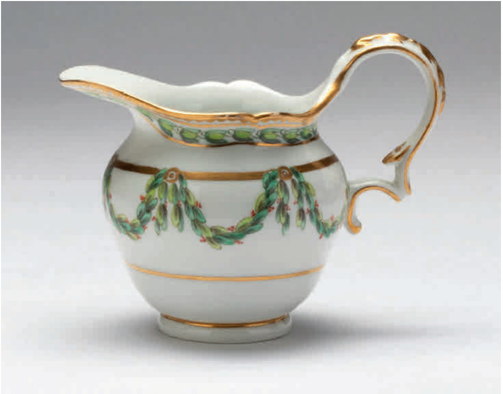
85. A Bristol ogee shaped milk jug, with harebell moulded scroll handle, painted in green and iron red with laurel swags, suspended from gilt roundels, within gilt line and green laurel borders, gilt dentil rim, 4" high, circa 1775, blue painted X mark and numeral 7