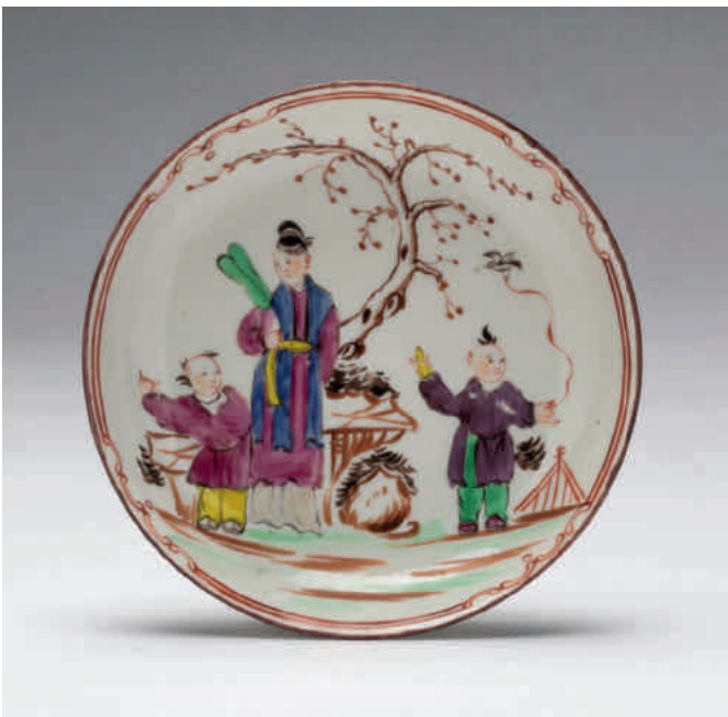
24. A Bristol saucer, painted in coloured enamels in Chinese Export style with a mother and two children before a tree, in a fenced garden, within an iron red line and scroll border, 5" diameter, circa 1772, blue painted B mark and numeral 6