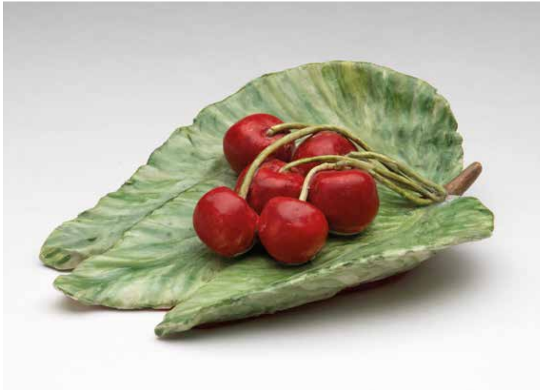
54. A porcelain model of a bunch of six cherries, on three pointed leaves, 5 ½" long, signed with monogram in blue and dated 1980