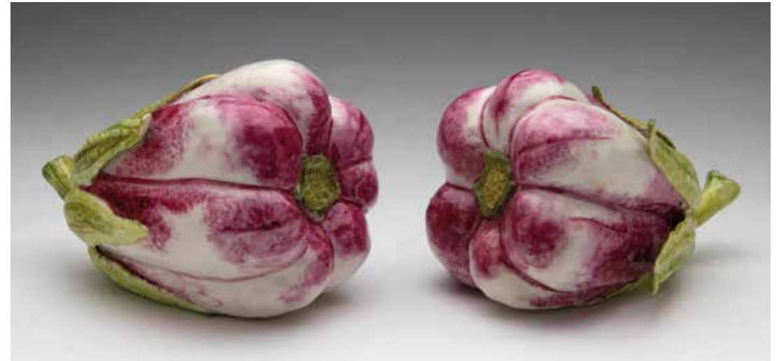
62. A pair of porcelain models of aubergines, each with stiff green leaves, 4 ¾" long, signed in black with monogram and dated '96