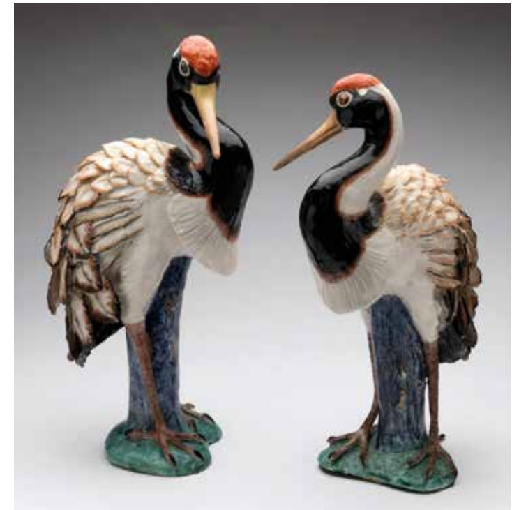
68. A pair of porcelain models of cranes, each standing, on turquoise mound base, 11 1/4" high, signed in blue with monogram and dated '87