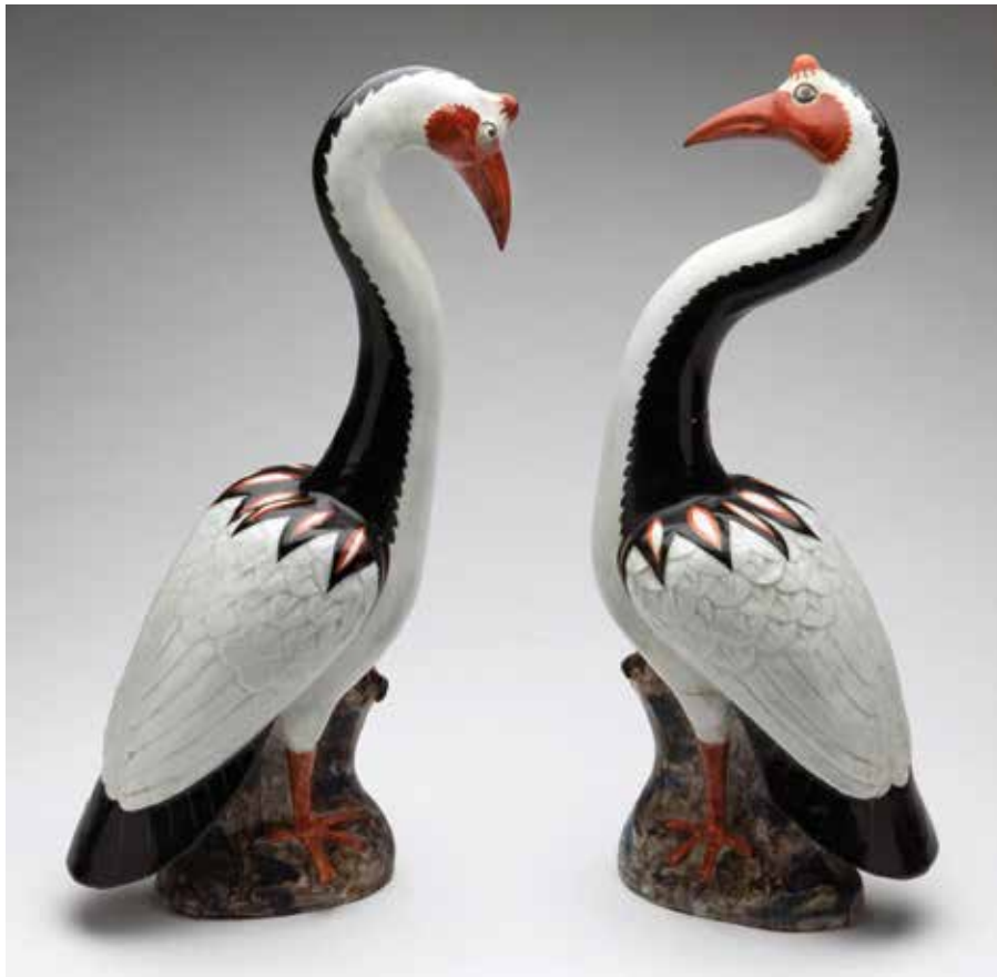
28. A pair of porcelain models of storks, in Chinese Export style, each on oval mound base, 13 ½" high, signed in blue with monogram and dated '80