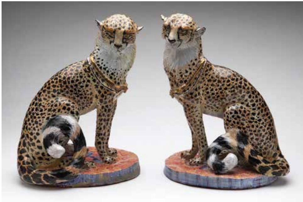
40. A pair of faience models of seated cheetahs, each wearing a silvered and gilded collar, on oval 'mosaic' base, 9 1/4" high, signed in black with monogram and dated '83/4