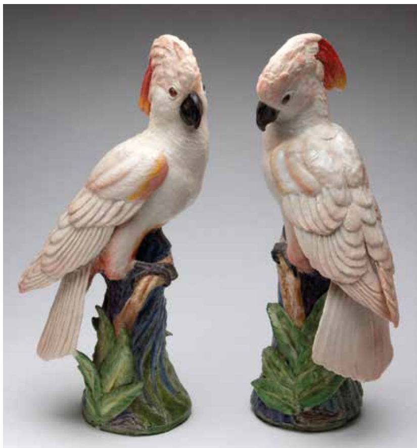
25. A pair of porcelain models of cockatoos, each perched on a leaf applied stump, 13 ¼" high, signed in black with monogram and dated '88