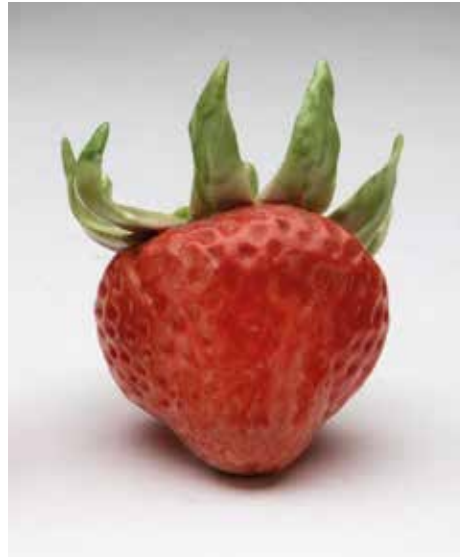
16. A porcelain model of a strawberry, 2" high, signed in black with monogram and dated '87