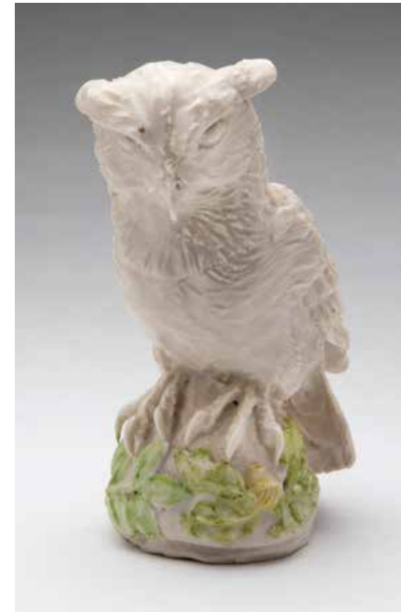
47. An unusual porcelain small model of a white owl, perched on oak leaf and acorn applied mound base, 4 ½" high, signed in black with monogram and dated '96