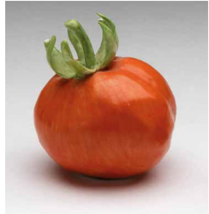
20. A porcelain model of a tomato, 2 ⅝” high, signed in black with monogram and dated ‘86