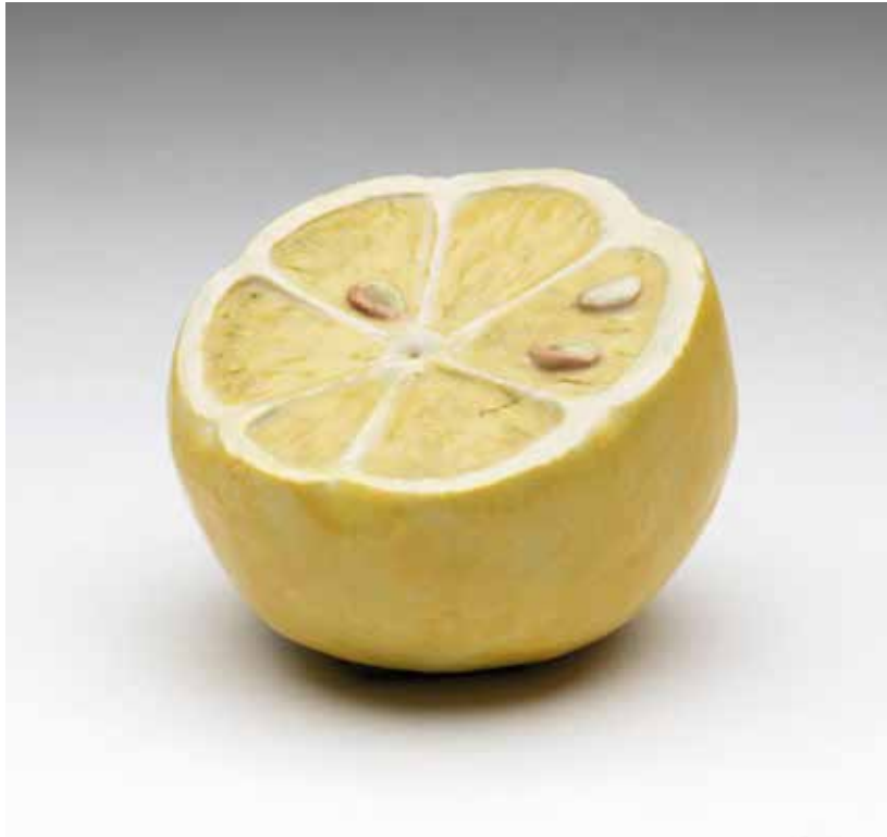
3. A porcelain model of a cut lemon, 2 5/8" wide, signed in blue with monogram and dated '86