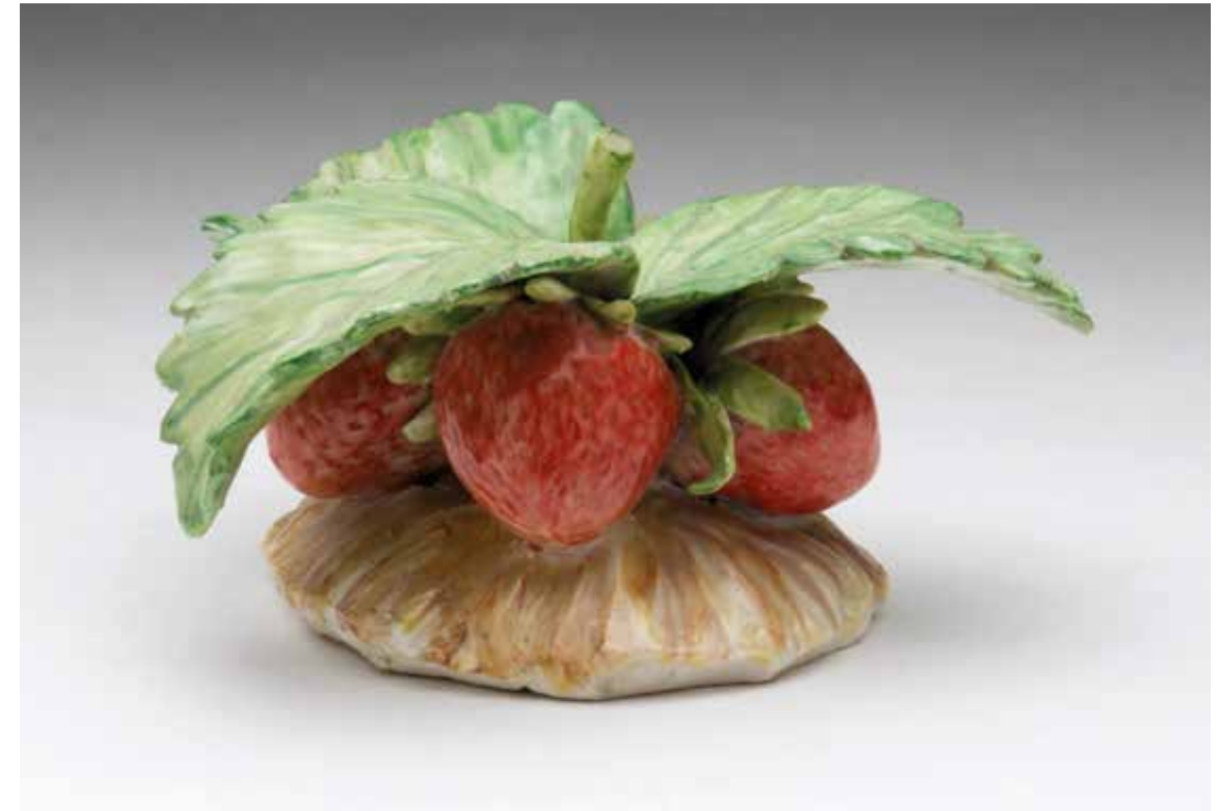
14. A porcelain group of four strawberries, beneath three leaves, on mound base, 4 \frac{3}{4} " wide overall, signed in black with monogram and dated '81