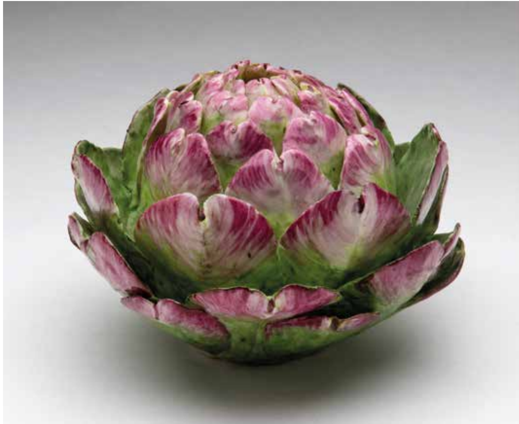
71. A porcelain model of an artichoke, 4 \frac{3}{4} " diameter, signed in black with monogram and dated '91