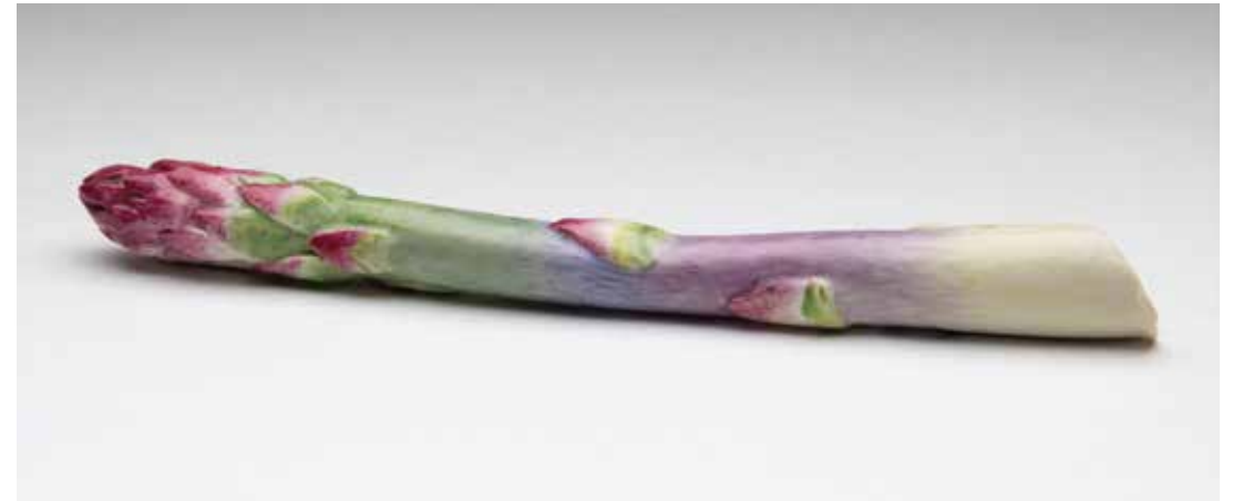
2. A porcelain stem of asparagus, 7 ½” long, signed in blue with monogram and dated ‘90