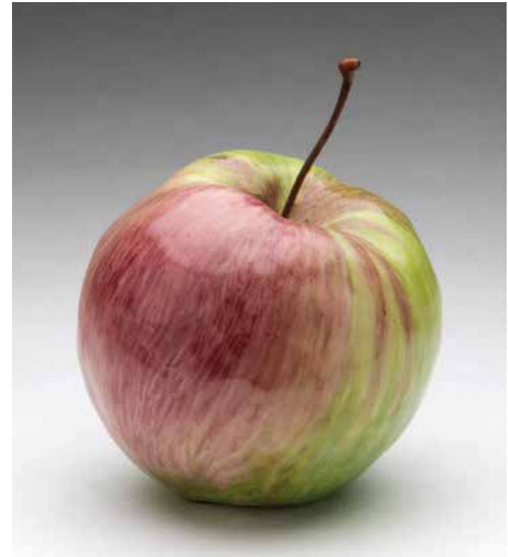
29. A porcelain model of an apple, 4" high, signed in blue with monogram and dated '89