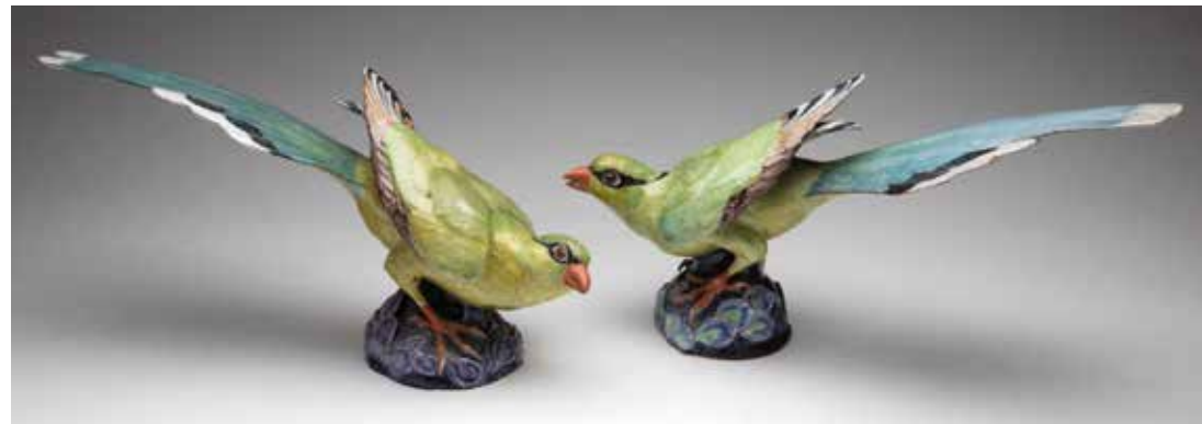
19. A pair of faience models of Greenfinches, each perched on a leaf applied mound base, 12 ½” long overall, signed in blue with monogram and dated ‘85