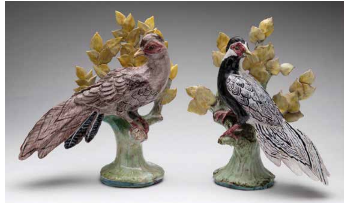
66. A pair of faience models of long tailed birds, each perched on a tree-stump, before leaves, on mound base, 8 ¼" high, signed in black with monogram, dated '81 and inscribed 'Blake'