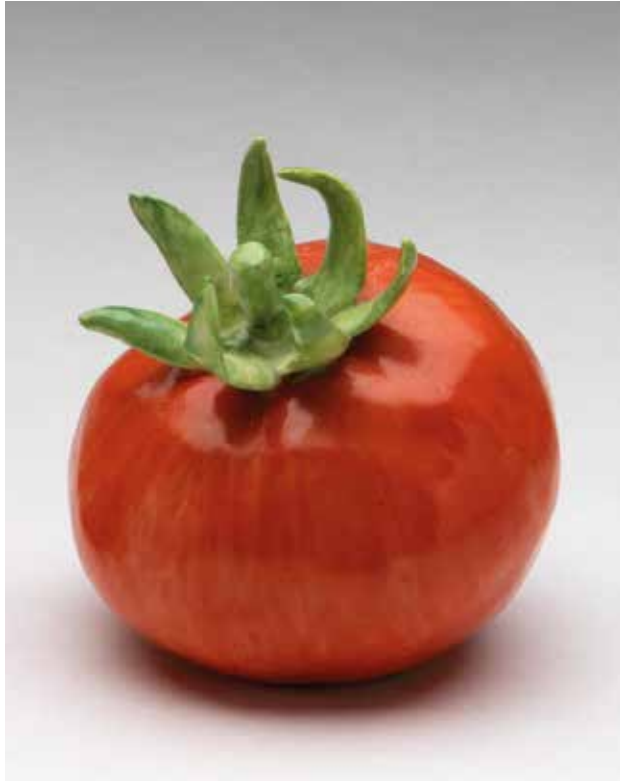
23. A porcelain model of a tomato, 2 1/8" high, signed in blue with monogram and dated '86