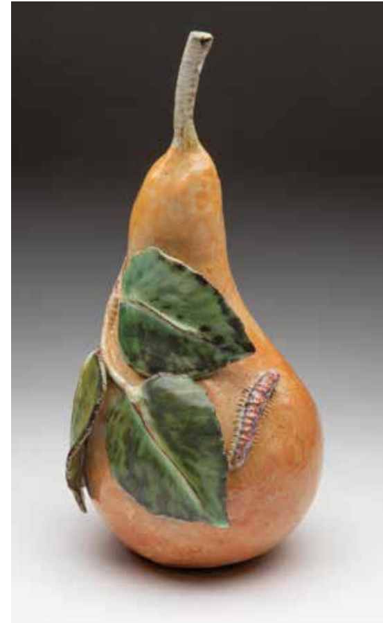
4. A faience model of a pear, modelled with a caterpillar, 7" high, signed in blue with monogram and dated '87