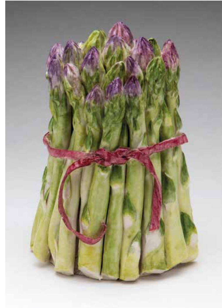
41. A porcelain bunch of asparagus, tied with a puce ribbon, 6 1/2" high, incised monogram and dated '89