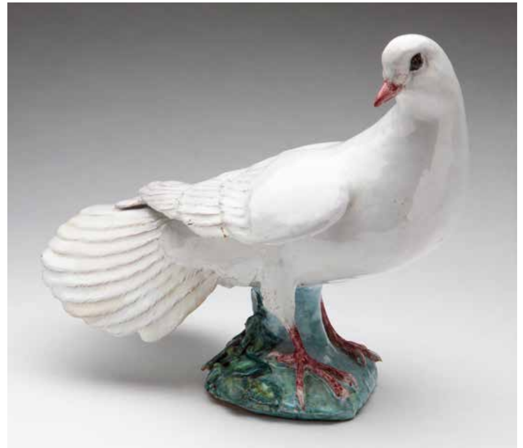
39. A faience model of a dove, the turquoise mound base applied with overlapping leaves, 7" high, signed in manganese with monogram and dated 1969