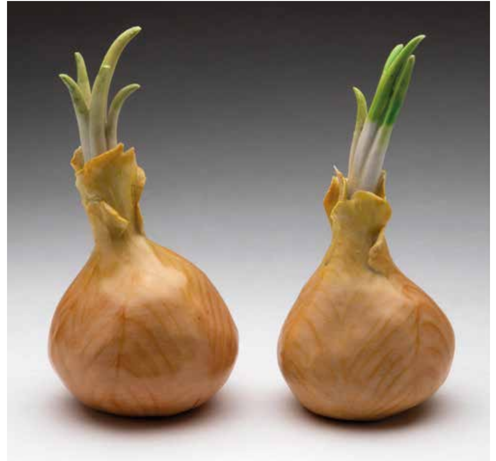
57. A pair of porcelain models of brown onions, each 6 1/4" high, signed in blue with monogram and dated '86