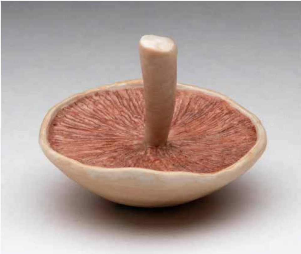
56. A porcelain model of a mushroom, 2" high, signed in black with monogram and dated '87