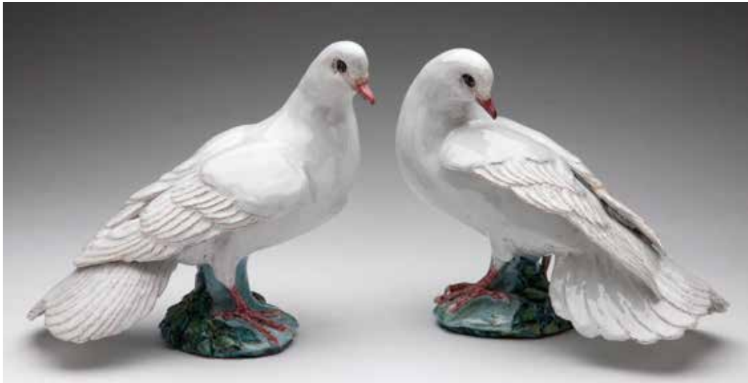
32. A pair of faience models of doves, each on turquoise mound base, applied with overlapping leaves, 7" high, signed in manganese with monogram and dated 1969