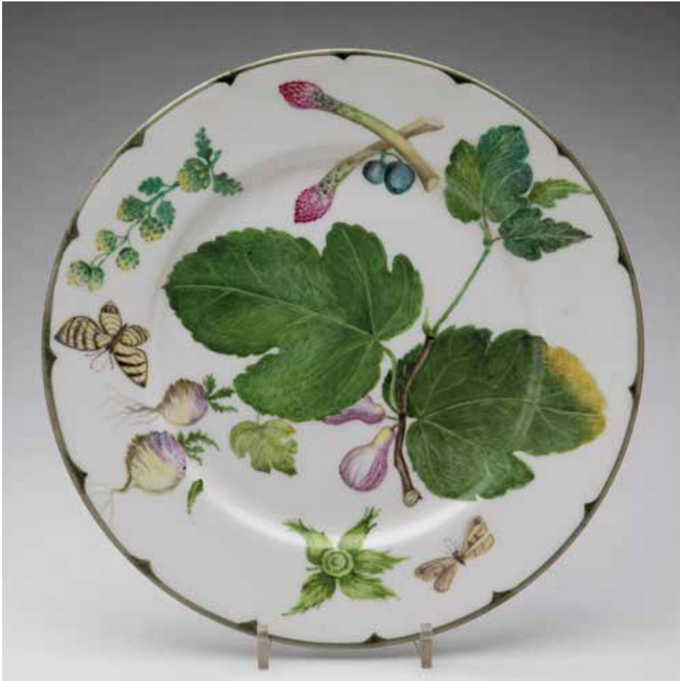
48. An English porcelain plate, finely painted in Chelsea Hans Sloane style, within a green border, 10 ¾" diameter, unmarked