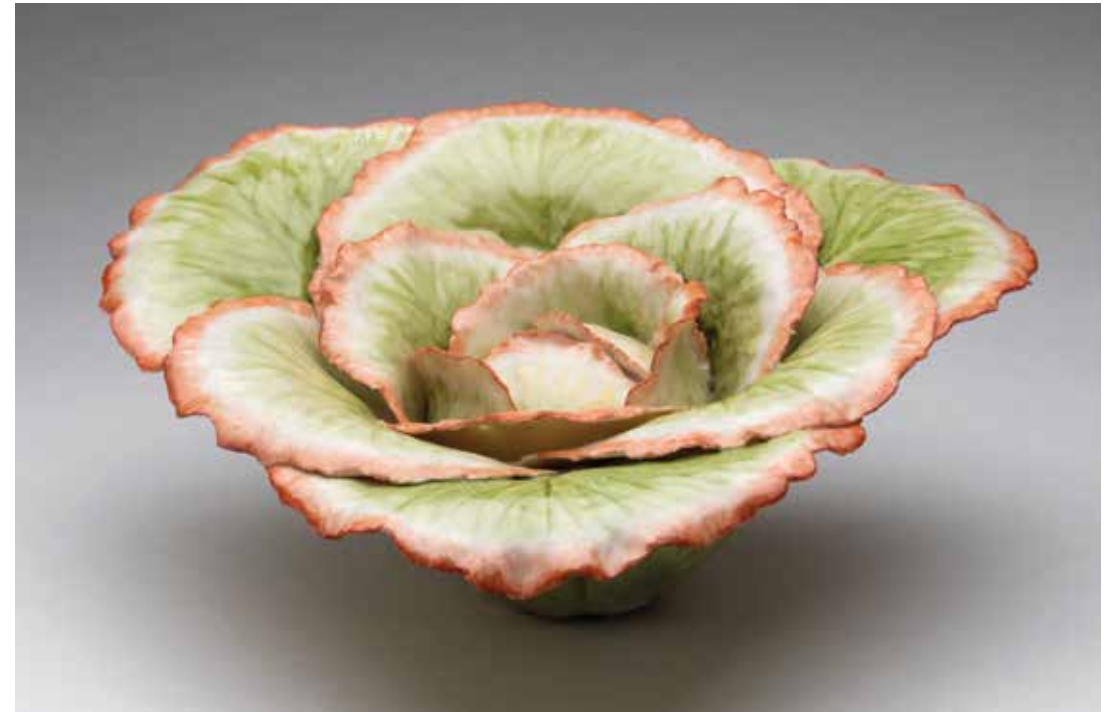
55. A porcelain model of a cabbage, the leaves edged in pale orange, 9 ½" wide, signed in black with monogram and dated '95