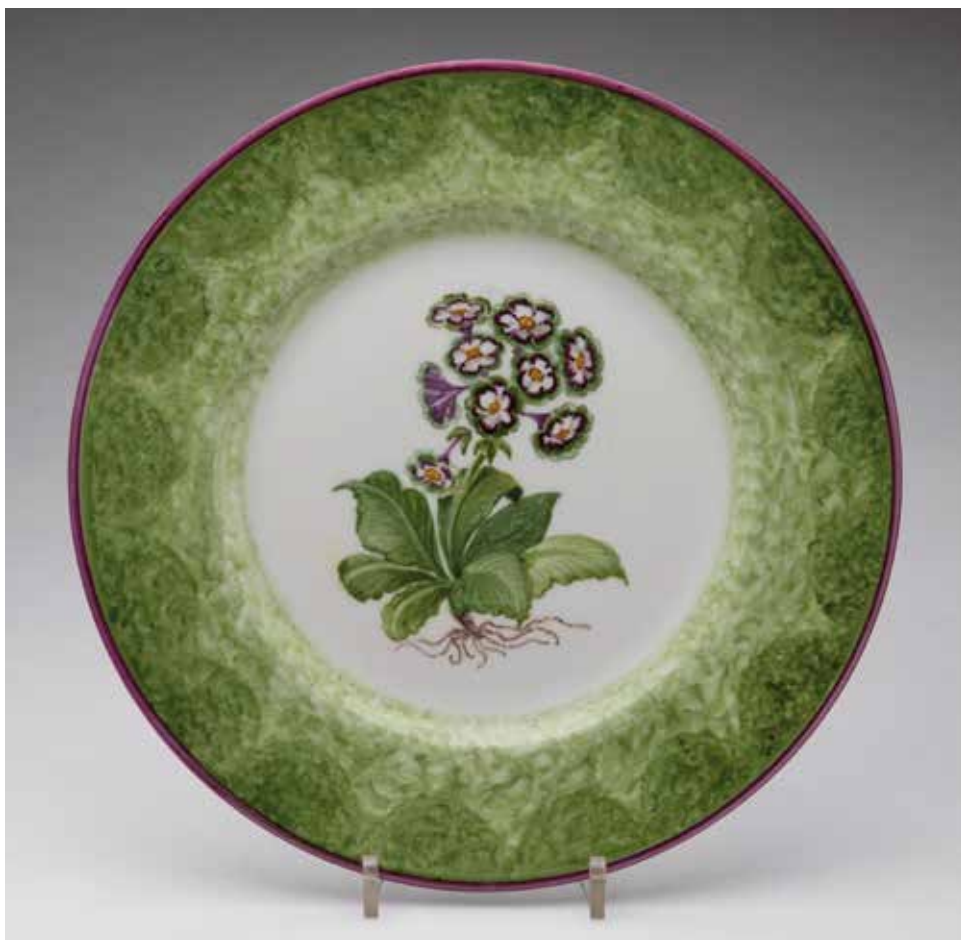
50. A Wedgwood plate, painted in coloured enamels with Auriculas, the shaded green border with purple line rim, 10 ¾" diameter, printed mark in black, and signed with monogram in black and dated '90