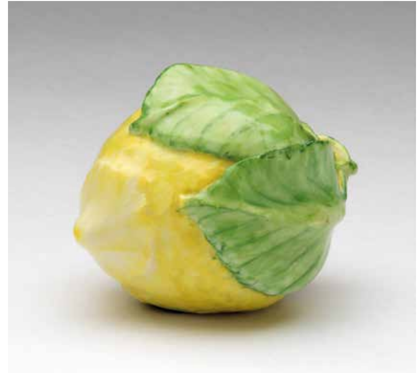
8. A porcelain model of a lemon and leaves, 2 ¾" wide, signed in black with monogram and dated '93