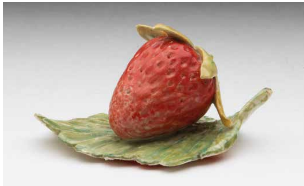
27. A a porcelain model of a strawberry, resting on a leaf, 3 ½" long, signed in black with monogram and dated '91