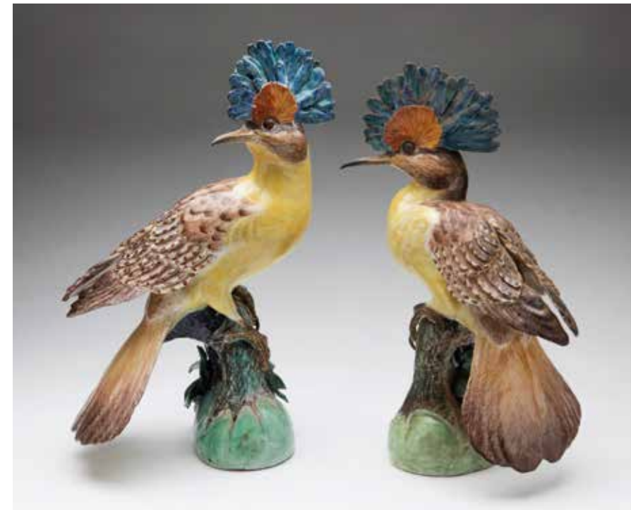
11. A pair of faience models of Hoopoes, each perched on a tree-stump, on turquoise mound base, 11 1/4" high, signed in manganese with monogram and indistinctly dated