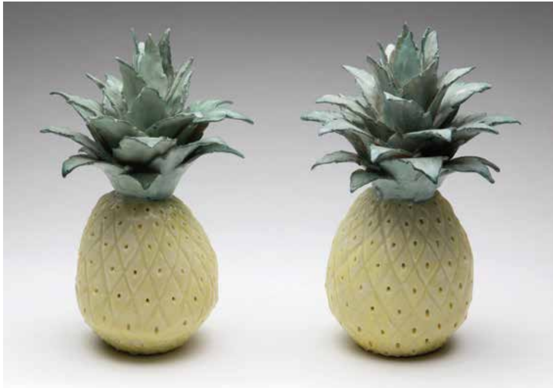
5. A pair of porcelain models of pineapples, 7" high, signed in blue with monogram and dated '03 Provenance; English Private Collection