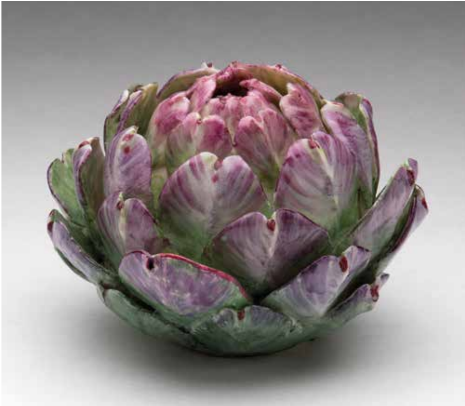
64. A porcelain model of a globe artichoke, 4 \frac{3}{4} " diameter, signed in blue with monogram and dated '90