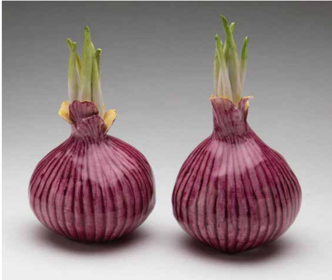
38. A pair of porcelain models of red onions, 6 ½" high, each signed in black with monogram and dated '96