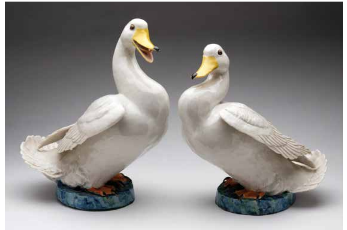
72. A pair of porcelain models of ducks, each on mottled blue base, 10 \frac{1}{4} " high, signed in blue with monogram and dated '87