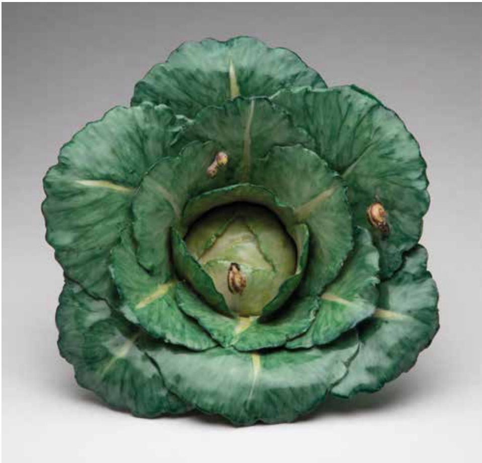
61. A porcelain model of a cabbage, modelled with two snails and a caterpillar, 8" wide, signed in black with monogram and dated '98