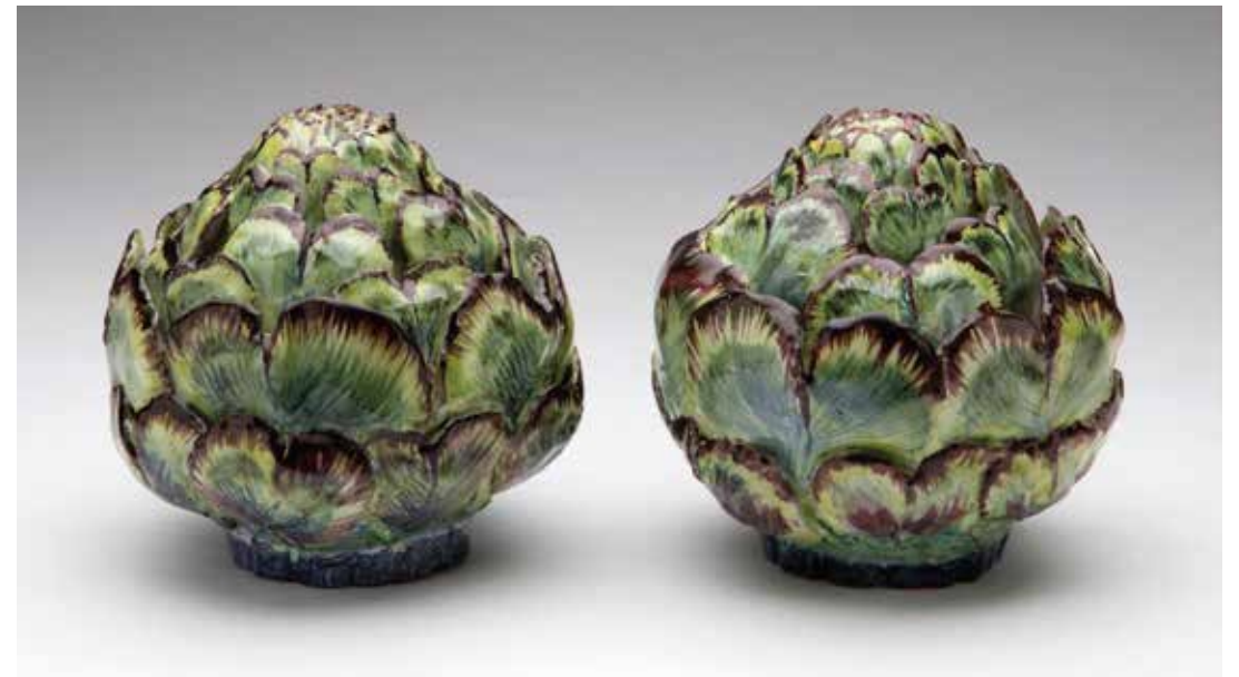
33. A pair of faience models of artichokes, 3 ¾", signed in blue with monogram and dated '70