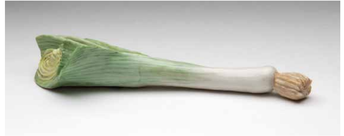
1. A porcelain model of a leek, 7 ¼” long, signed in blue with monogram and dated ‘86