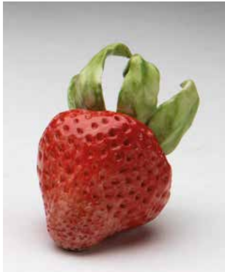
17. A porcelain model of a strawberry, 2 1/4" long, signed in black with monogram