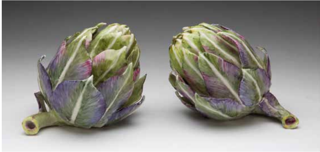
22. A pair of porcelain models of artichokes, 5 1/4" wide, signed in black with monogram and dated '94