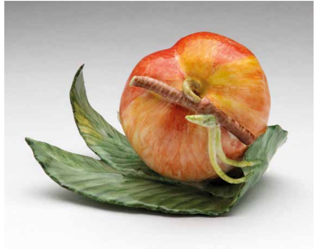
43. A porcelain model of a peach, resting on three leaves, 4" wide, signed in blue with monogram and dated '88