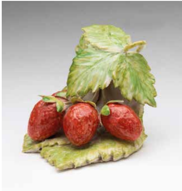
9. A porcelain group of four strawberries and leaves, 2 1/2" high, incised monogram and dated '79