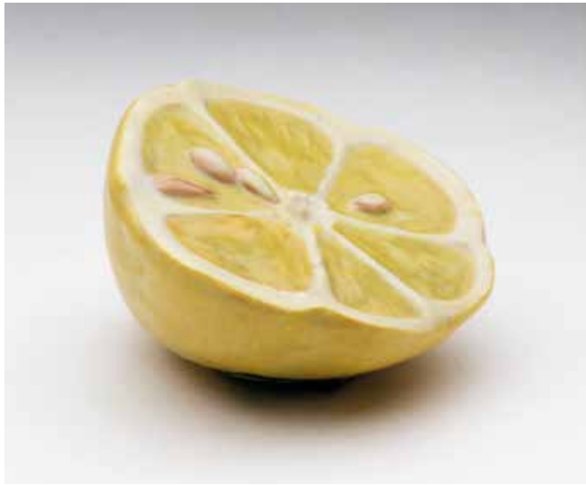
58. A porcelain model of a cut lemon, 2 ¾" wide, signed in blue with monogram and dated '86