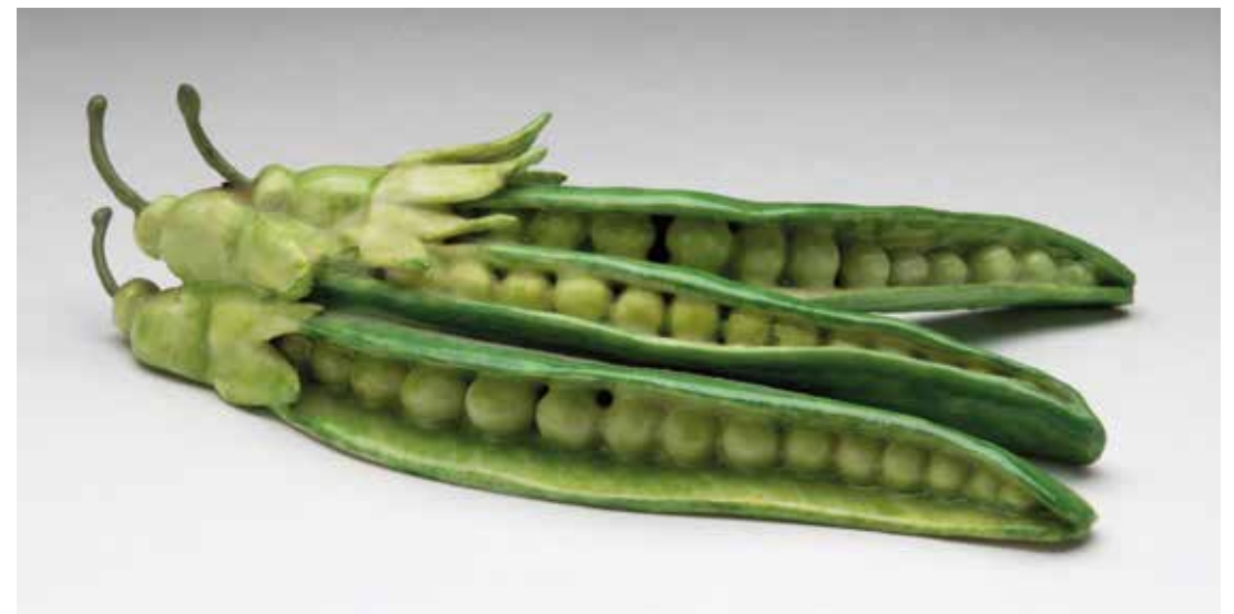
21. A porcelain model of three pods of peas, 6 ½” long, signed in black with monogram, indistinctly dated and with initial ‘K’