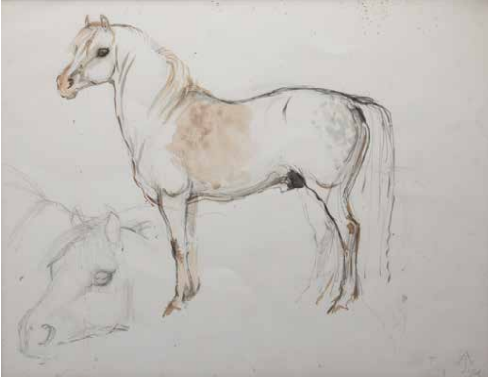
52. A pencil preparatory drawing for the model of two ponies and a foal, 10 \frac{3}{4} x 13 \frac{3}{4} ", signed with monogram and dated '81

It is rare for preparatory drawings by Lady Aberdeen to survive