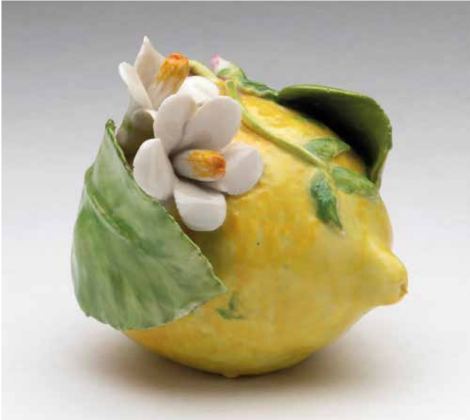
67. A porcelain model of a lemon, modelled with blossom and leaves, 3" high, signed in black with monogram and dated '86