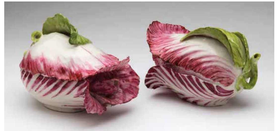
45. A pair of porcelain models of variegated tulips, after Chelsea models, each stalk loop handle modelled with leaves, 5 \frac{1}{4} " long, signed in black with monogram and dated '94