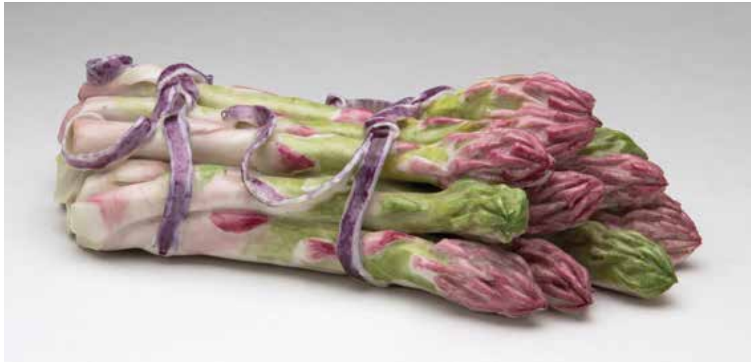
36. A porcelain group of fifteen stems of asparagus, tied with two purple ribbons, 6 \frac{3}{4} " wide, signed with monogram in blue and dated '79