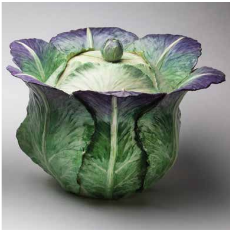
46. An exceptional pair of large cabbage shaped bowls and covers, each with flared rim and cabbage shaped knop, 14 ½" diameter, signed in black with monogram and dated '98