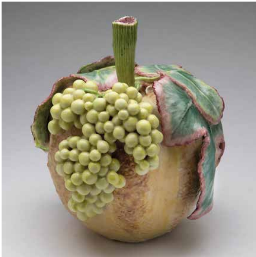
59. A porcelain model of a pumpkin, modelled with leaves and grapes, 7 ¼" high, unsigned