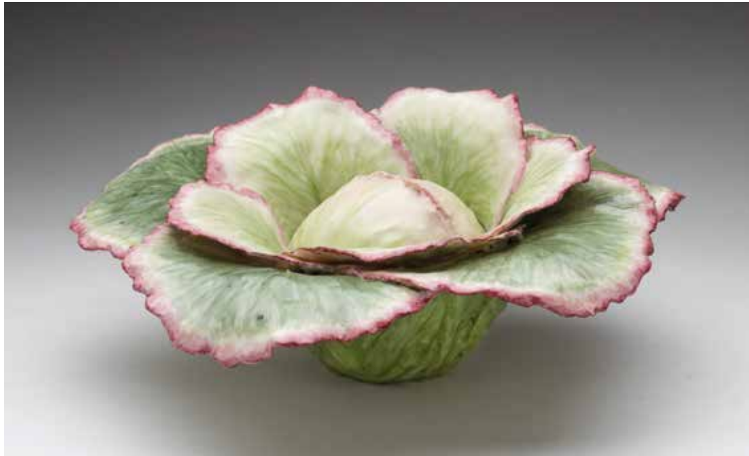
7. A porcelain model of a cabbage, the leaves edged in purple, 9" diameter, signed in black with monogram and dated '95