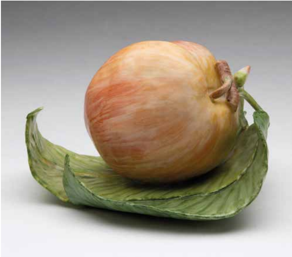
69. A porcelain model of a peach, resting on two leaves, 4 ½" long, signed in blue with monogram and dated '89