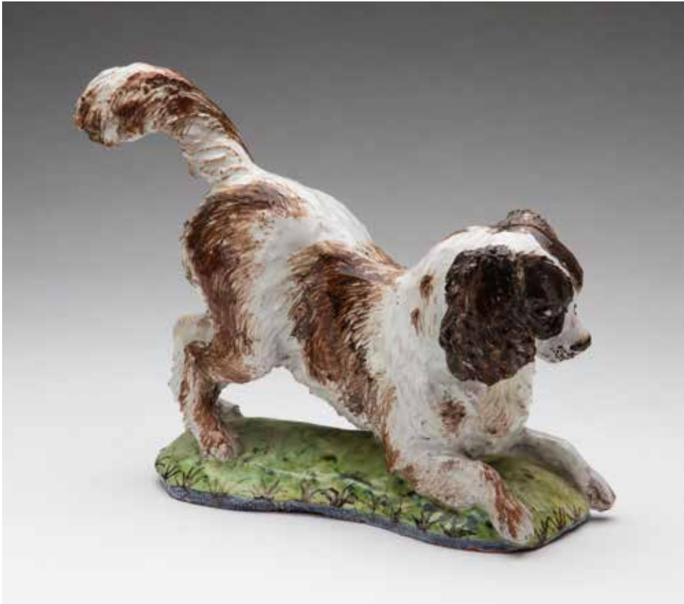
34. An unusual faience model of a playful spaniel, on green glazed mound base, 7" wide, signed in brown with monogram and dated '70