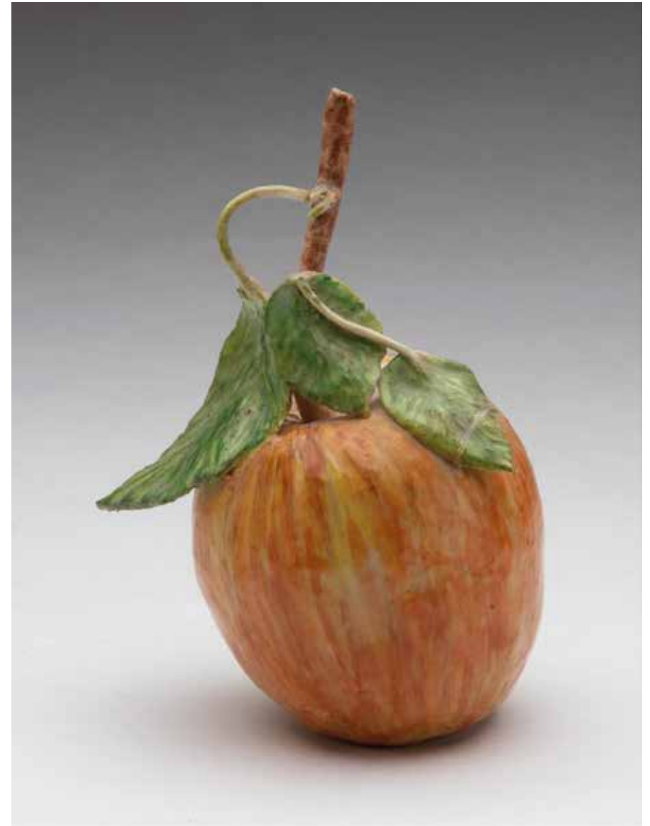
70. A porcelain model of an apple, the long stalk with three leaves, 4 ½" high, unsigned