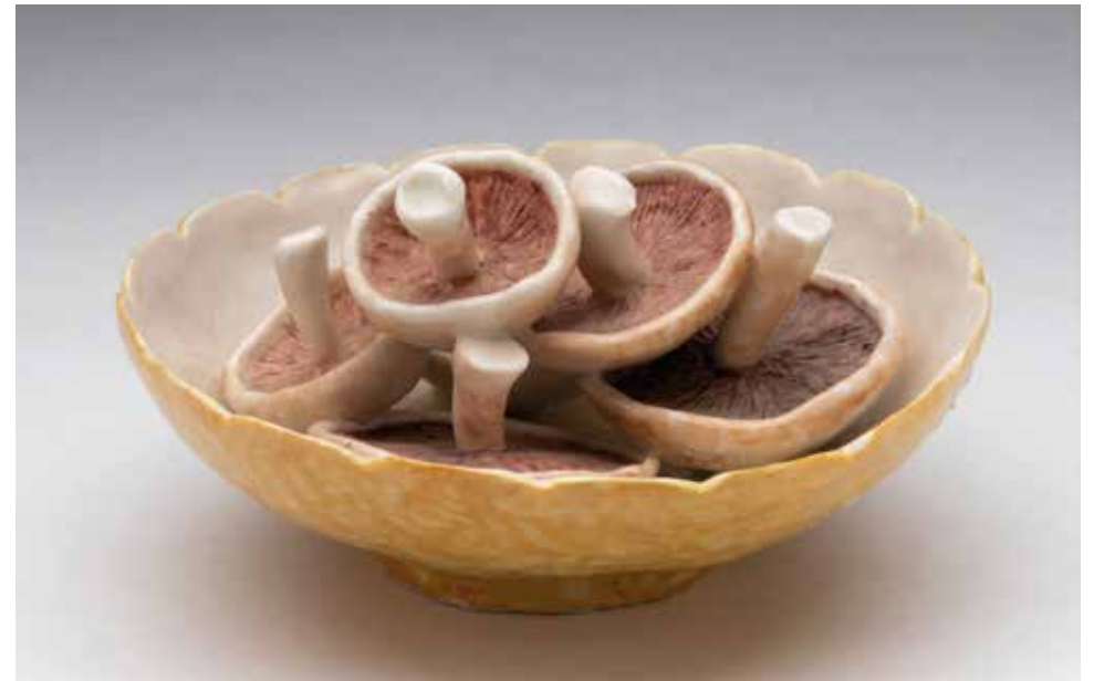
31. An unusual porcelain shallow round bowl, with mottled yellow exterior, containing six small mushrooms, 4 ¾" diameter, signed in blue with monogram and dated '90