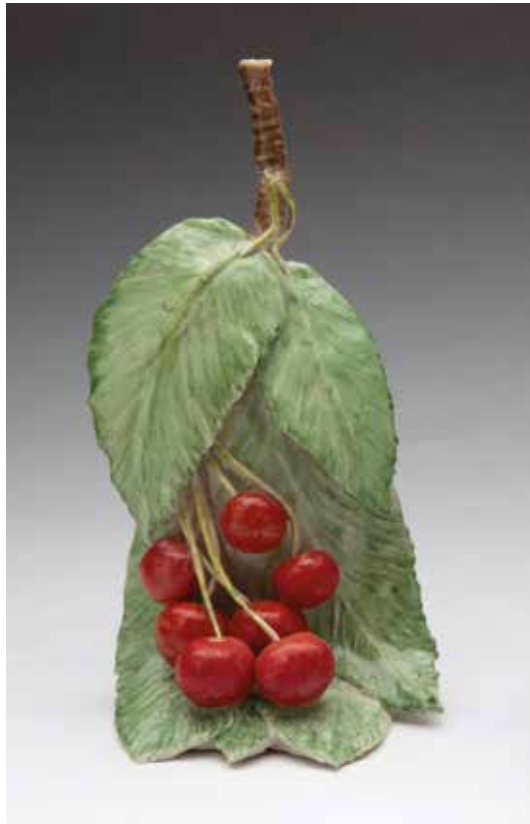
12. A porcelain group of seven cherries, suspended from leaves, 6 \frac{3}{4} " high, signed in green with monogram and dated '79