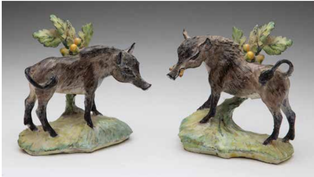
30. A pair of unusual faience models of standing boars, each before an oak tree stump, with acorns, on mound base, 4 ¾" high, signed in manganese with monogram