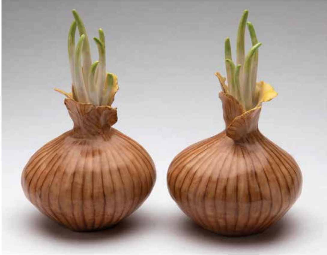
73. A pair of porcelain models of brown onions, each 5 1/2" high, signed in black with monogram and dated '98