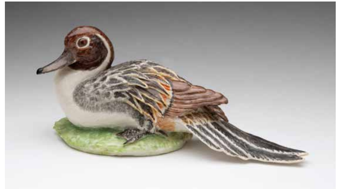
6. A porcelain model of a long-tailed duck, on oval base, 8" long, signed in blue with monogram and dated '87