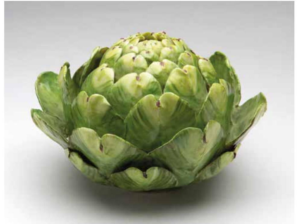
37. A porcelain model of an artichoke, 6" diameter, signed in black with monogram and dated '92