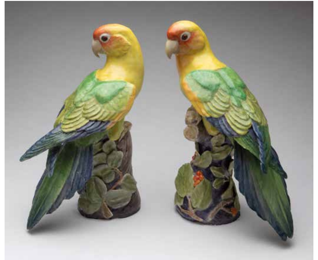
24. A pair of porcelain models of brightly coloured parrots, each perched on a leaf applied stump, 10" high, signed in blue with monogram and dated '84