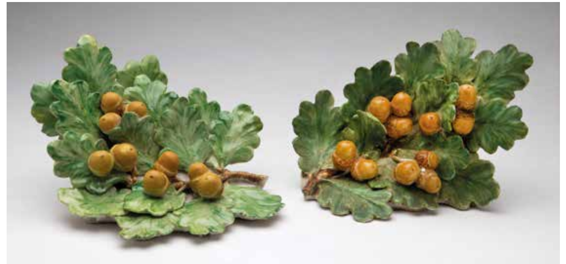
60. An unusual pair of porcelain groups of oak leaves and acorns, 6 ¼" wide, signed in brown and blue with monogram and dated '79 and '81