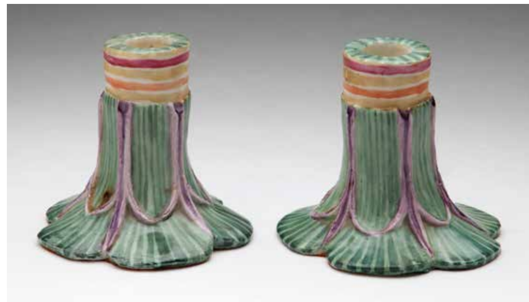
26. A pair of unusual porcelain short candlesticks, modelled as spreading leaves, and with purple, orange and brown bands to the rims, 3 ¼" high, signed in black with monogram and dated '84