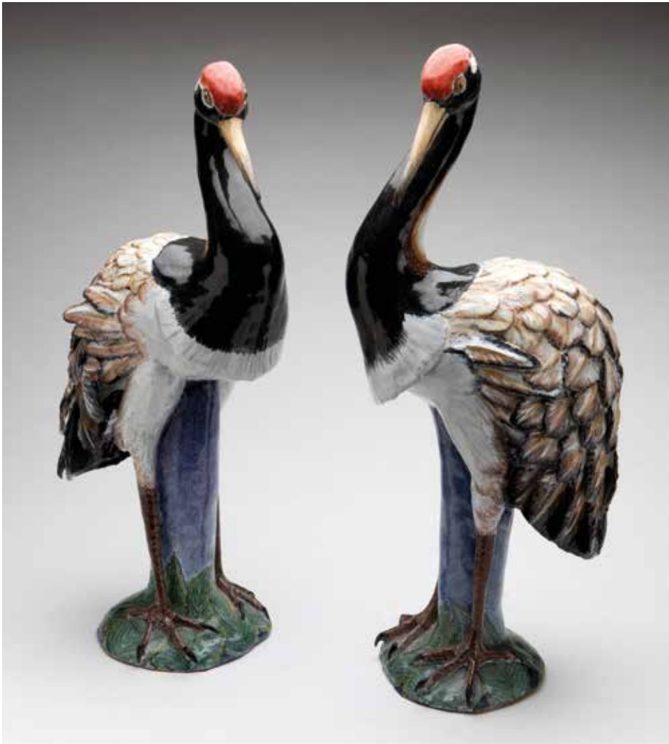
44. A pair of faience large models of cranes, each on leaf modelled base, 15 \frac{3}{4} " high, signed in blue with monogram and dated '88