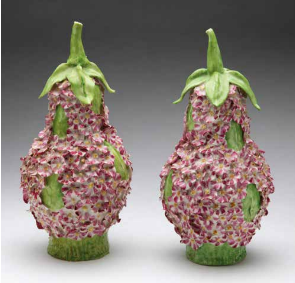
65. A pair of porcelain models of hydrangea blossom, applied with blossom, 8 ¾" high, signed in black with monogram and dated '93