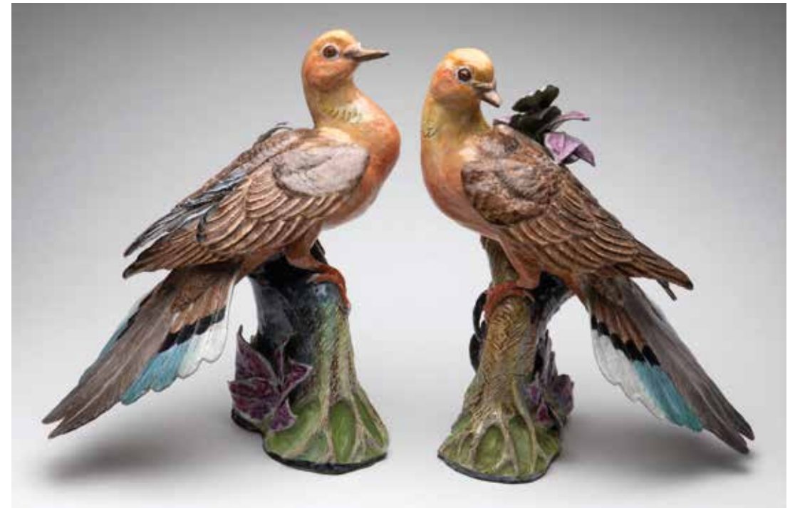
49. A pair of faience large models of Turtle Doves, each perched on a tree-stump, the stump applied with purple leaves, 11 ¾" high, signed in blue with monogram and dated 1985