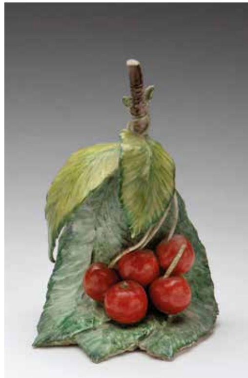
13. A porcelain group of five cherries, suspended from leaves, 5 \frac{1}{2} " high, signed in green with monogram and dated '79