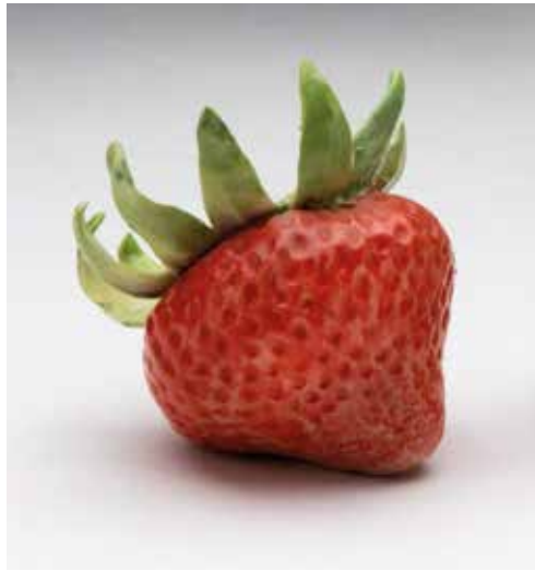
15. A porcelain model of a strawberry, 2" high, signed in black with monogram and dated '87