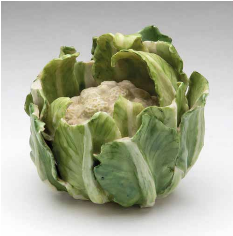
42. A porcelain model of a cauliflower, 4" diameter, signed in blue with monogram