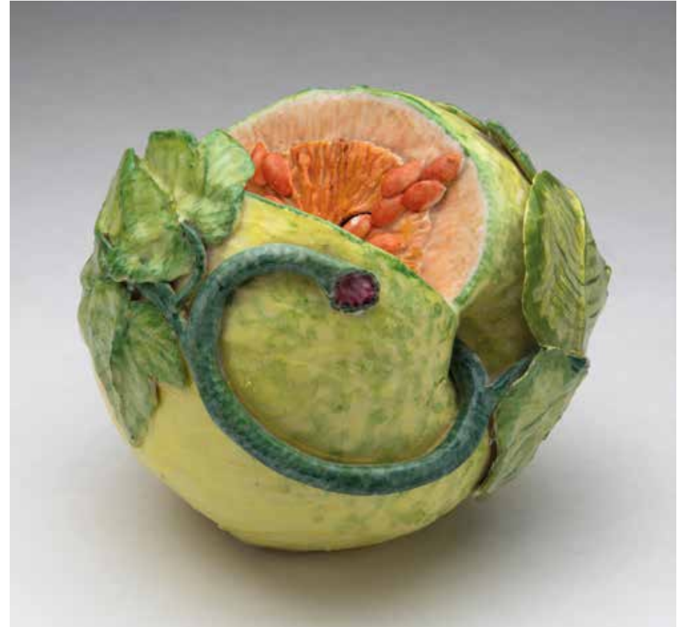
74. A porcelain model of a cut melon, the stalk loop handle with leaf terminals, 4 1/4" wide, signed in blue with monogram and dated '80