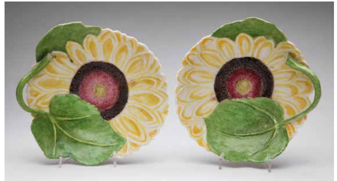
35. A pair of porcelain dishes, after Chelsea originals, each in the form of a sunflower, the stalk loop handle with a leaf terminal, 6 3/4" wide, signed in blue with monogram '03