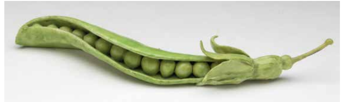
18. A porcelain pod of peas, 6 3/4" long, signed in blue with monogram and dated '88