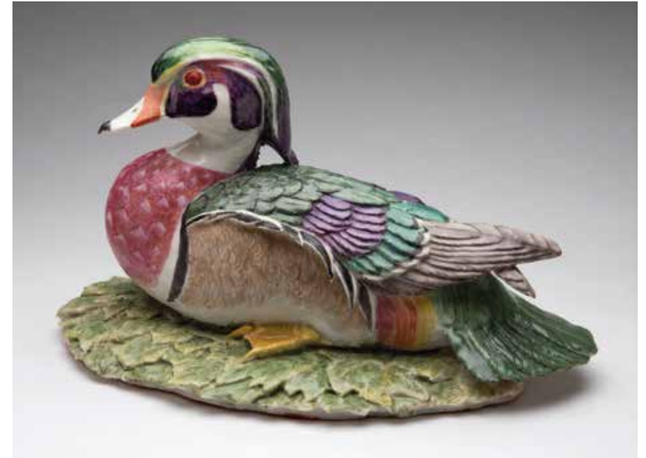
53. A porcelain large model of a duck, the oval green glazed base with overlapping leaves, 11 \frac{1}{2} " wide, signed with monogram in blue and dated '84

It is rare for preparatory drawings by Lady Aberdeen to survive