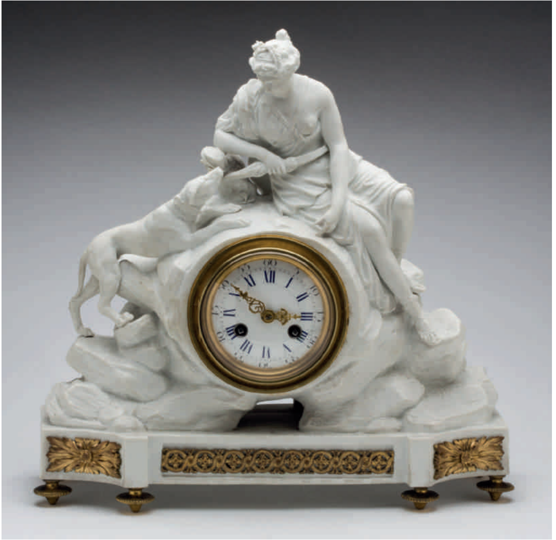
42. A rare Derby biscuit porcelain cased mantel clock, modelled as Diana the Huntress, holding a bow, a hound at her side, on a rocky mound containing a gilt metal cased round white enamel dial, with blue numerals, on breakfront base applied with gilt metal flower head mounts and a pierced trellis band, on turned and beaded feet, the French twin train striking movement with silk suspension, and outside countwheel with pendulum, 12 \frac{3}{4} " high, circa 1785, incised crowned crossed batons mark and number 17 and initial B