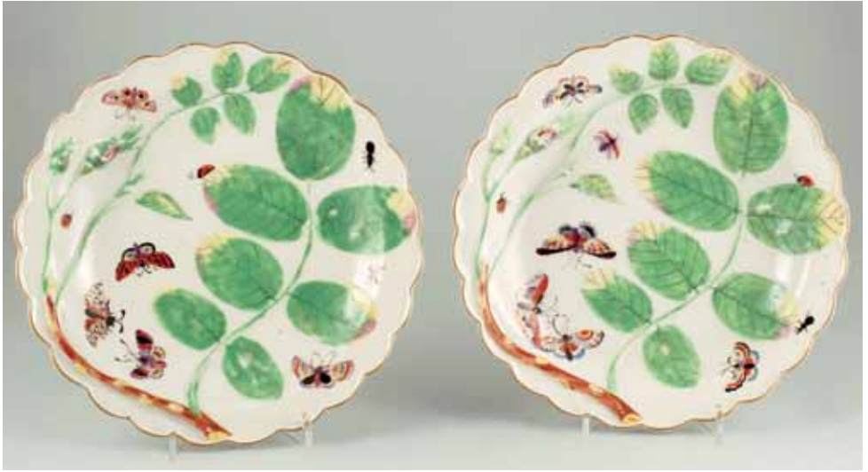
28. A pair of Worcester 'Blind Earl' plates, each moulded in relief with rose buds and leaves, and brightly painted in coloured enamels in the London atelier of James Giles with numerous butterflies and insects, including ladybirds and unusual black bugs, the leaves shaded in green, yellow and pink, within a lobed border with gilt line rim, 7 3/4" diameter, circa 1770, no mark.

Provenance: With dealers' label for D M and P Manheim.