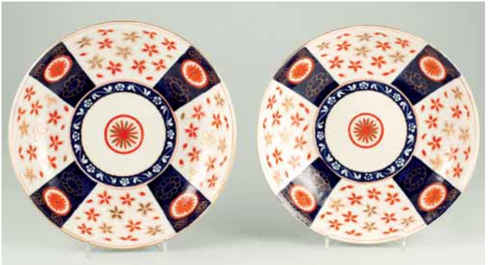
29. A pair of Worcester saucer dishes, each decorated in Imari style with a roundel, within an underglaze blue band, the border with radiating panels of iron red and gilt flowerheads, alternating with blue ground bands, 7 1/2" diameter, circa 1770, blue fret marks.

Provenance: With dealers' label for D M and P Manheim.