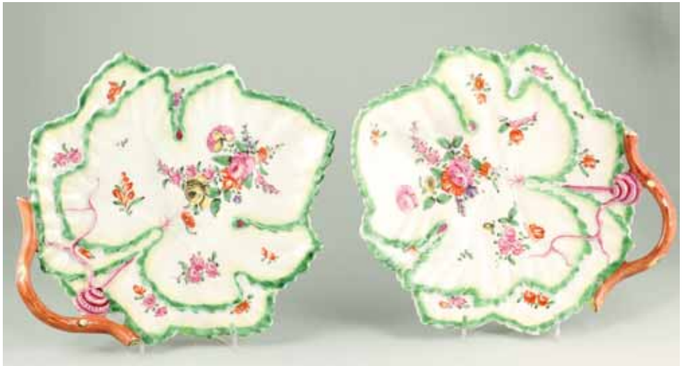
33. A rare pair of Worcester dishes, each in the form of overlapping leaves, and with stalk loop handle with snail terminal, painted in coloured enamels with sprays of flowers and leaves, and scattered flowers, within shaded green and yellow borders, 9 1/2" wide, circa 1772, no marks.