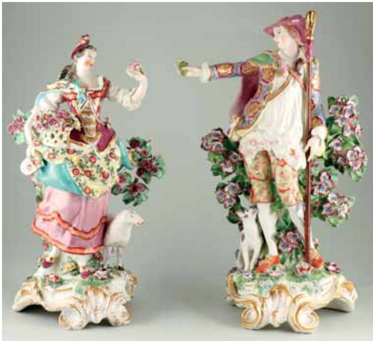
45. A pair of Chelsea large figures of the Imperial Shepherd and Shepherdess, each standing; he holding a crook, a flower in his outstretched arm, she holding a basket of flowers, a posy in her outstretched arm, each richly decorated in coloured enamels, before floral bogage, the flower applied scroll moulded bases picked out in gilt, 13" high, circa 1765, gold anchor marks.