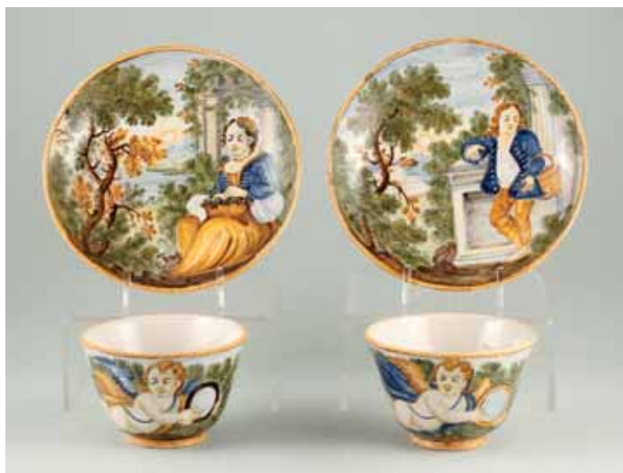
66. A pair of Castelli teabowls and saucers, each finely painted in coloured enamels, the teabowls with putto, the saucers with a young boy, standing, holding a basket in a garden, and a young woman seated in wooded river landscape, within brown and ochre line borders, circa 1760.

Provenance: Earl Spencer, Althorp House, Northamptonshire.