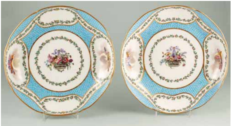
60. A pair of Sevres round dishes, from the Sefton Service, each finely painted in coloured enamels with a ribbon tied basket of flowers, the turquoise ground with two clusters of musical trophies, alternating with two vacant cartouches, and entwined with a laurel garland, gilt line rim, 8 ¼" diameter, circa 1770, painted marks in blue.