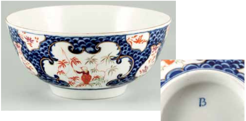
23. A Worcester round bowl, from the Bodenham Service, finely painted in coloured enamels with Chinese figures in landscapes, within gilt cartouches, and with mirror shaped panels of puce and iron red flowers and leaves, on a blue scale ground, 6" diameter, circa 1768, rare blue painted B mark.

Provenance: Earl Spencer, Althorp House, Northamptonshire.