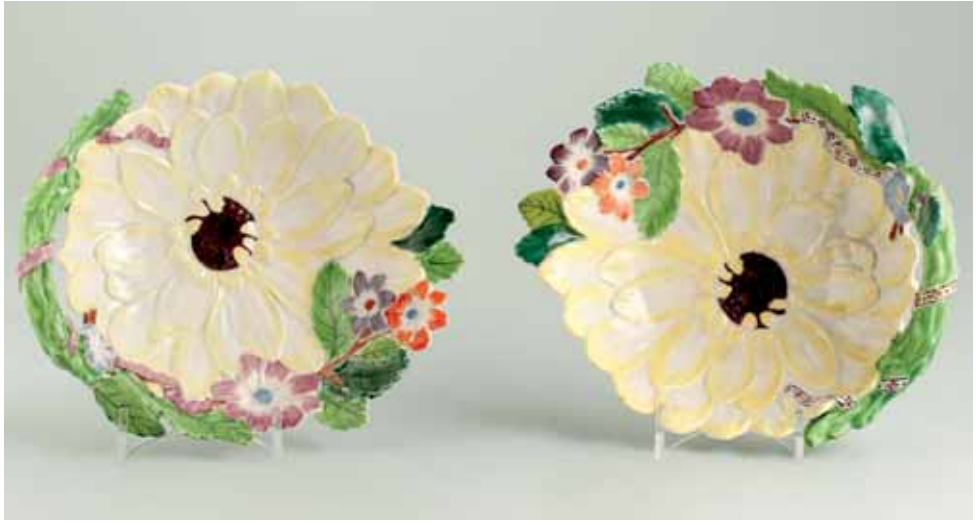
40. A pair of Chelsea sunflower shaped dishes, each with stalk loop handle entwined with a ribbon, and one side moulded with flowers and leaves and decorated in coloured enamels, 6" wide, circa 1755, one with red anchor mark.