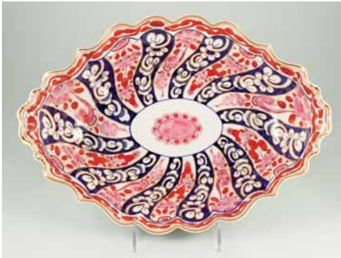
59. A Flight Worcester large fluted oval dish, painted in underglaze blue, iron red, puce and gilt with the Queen Charlotte pattern, 13 ¾" wide, circa 1785, no mark.