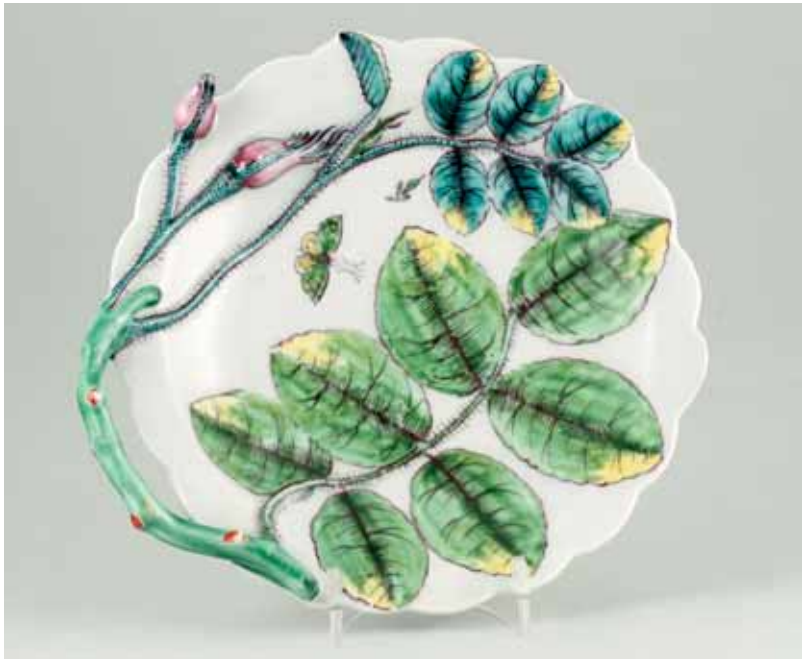
30. A Worcester 'Blind Earl' sweetmeat dish, the 'stalk' loop handle moulded in relief with rose bud and leaf terminals, finely picked out in coloured enamels, and painted with a butterfly, 6½" wide, circa 1756-58, no mark.