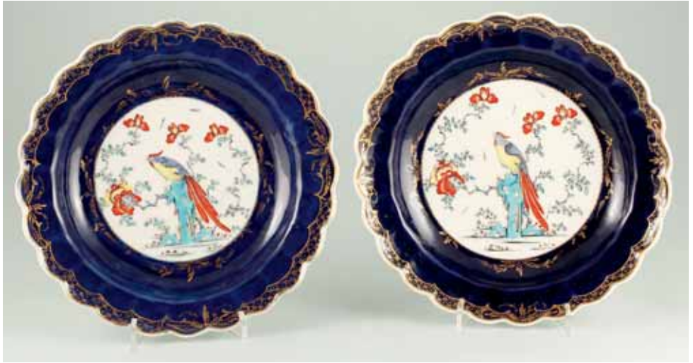
22. A pair of Worcester plates, each painted in kakiemon palette with a long tailed bird perched on rockwork, and flowering branches, the broad blue ground border with gilt leaves, within a gilt leaf and diaper band, 7 ½" diameter, circa 1772, script W marks.