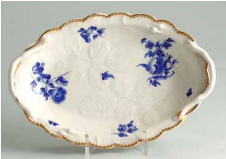
20. A Worcester lobed oval spoon tray, with two 'twig' loop handles, moulded in relief with roses and leaves, in 'Blind Earl' style, and painted in dry blue enamel with scattered flowers, within a gilt dentil rim, 6 5 / 8 " wide, circa 1772, no mark.