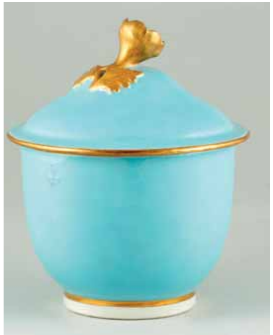
31. A Worcester round sucrier and domed cover, with solid turquoise ground, the flower and leaf knob decorated in gilt, within gilt line borders, 5¼" high, circa 1772, no mark.

Provenance: Australian Private Collection.