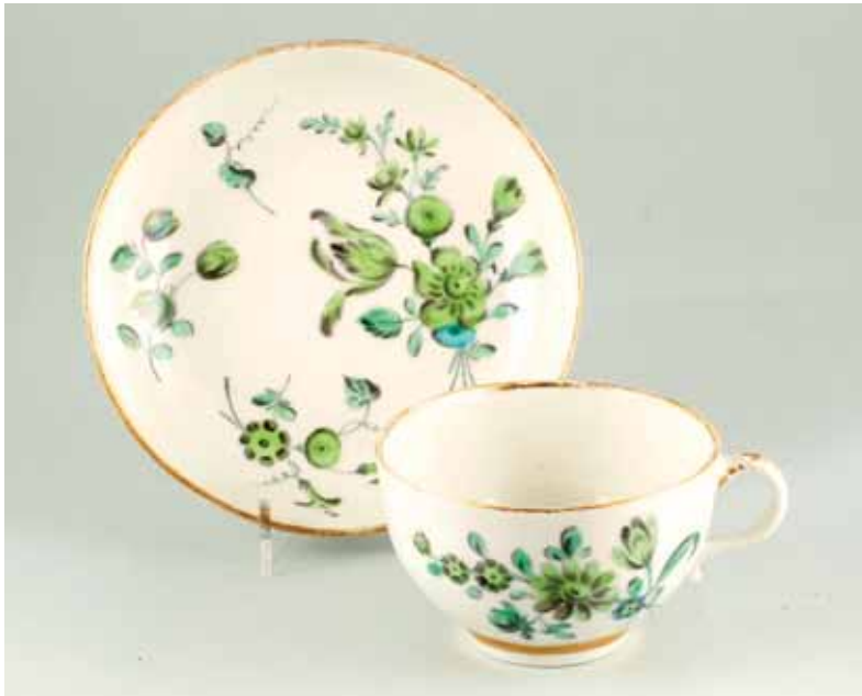
21. A Worcester teacup and saucer, the cup with scroll handle, painted in the London atelier of James Giles in shades of green enamel with flowersprays and scattered flowers, including a 'divergent' tulip, within gilt line borders, circa 1772, blue crossed swords and numeral 9 marks.