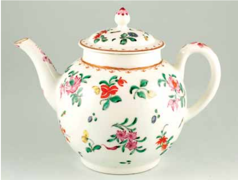
32. A Worcester globular teapot and cover, with loop handle and pointed knob, boldly painted in coloured enamels with numerous scattered flowers, leaves and insects, within iron red and gilt spearhead bands, the handle, knob and spout picked out in puce, 5 3/4" high, circa 1765, no mark.