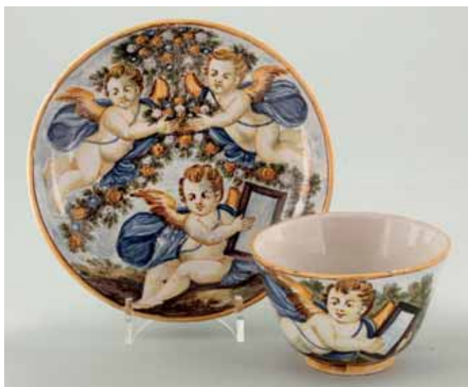
67. A Castelli teabowl and saucer, finely painted in coloured enamels, the teabowl with a putto in a wooded landscape, the saucer with three putto amidst a flower garland, within brown and ochre line borders, circa 1760.

Provenance: Earl Spencer, Althorp House, Northamptonshire.