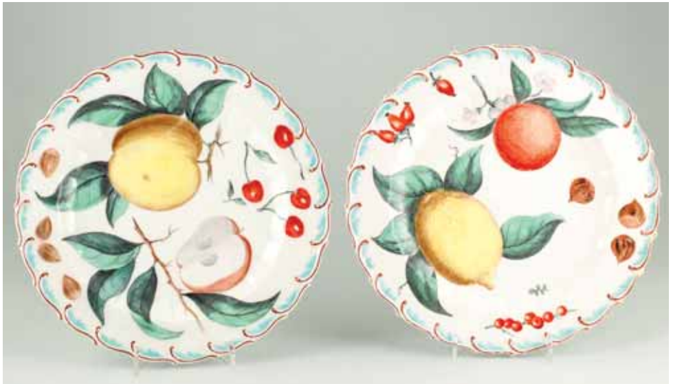
44. A pair of Chelsea plates, boldly painted in coloured enamels, one with an apple and a cut pear and cherries, the other with a lemon, a peach, nuts and berries, the 'feather' moulded border picked out in turquoise and brown, 8 ¼" diameter, circa 1765, brown anchor marks.